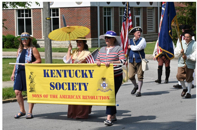
Georgetown citizens applauded the DAR and SAR Chapters.