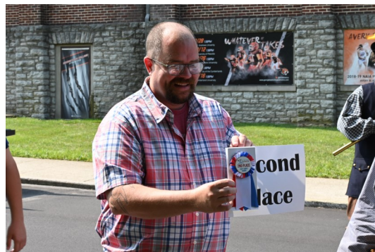
KSSAR placed second in Parade Competition !