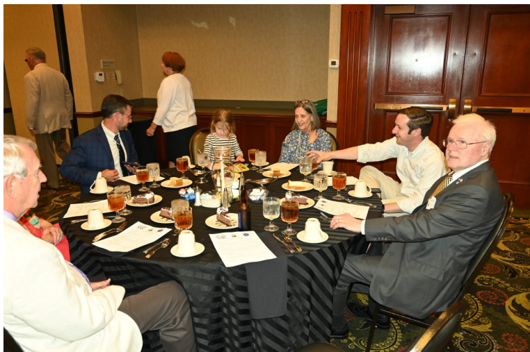
Lafayette Chapter members enjoying the evening dinner meeting with fellow compatriots and guests. The evening's festivities were held June 14th at the Embassy Suites in Lexington.