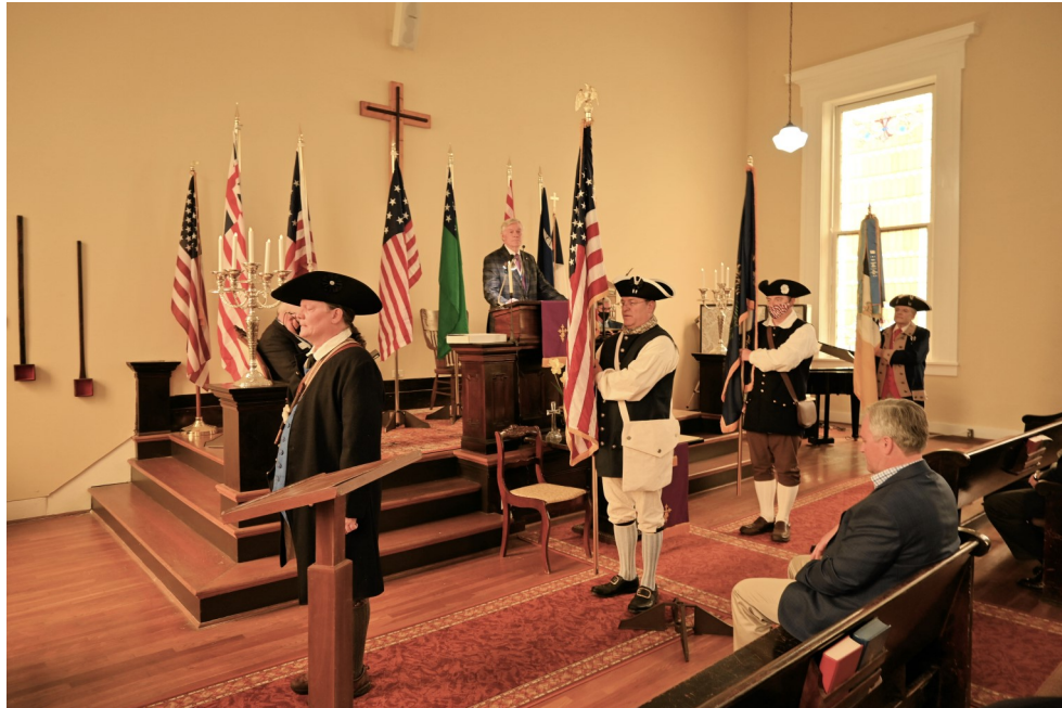
Presentation of Colors