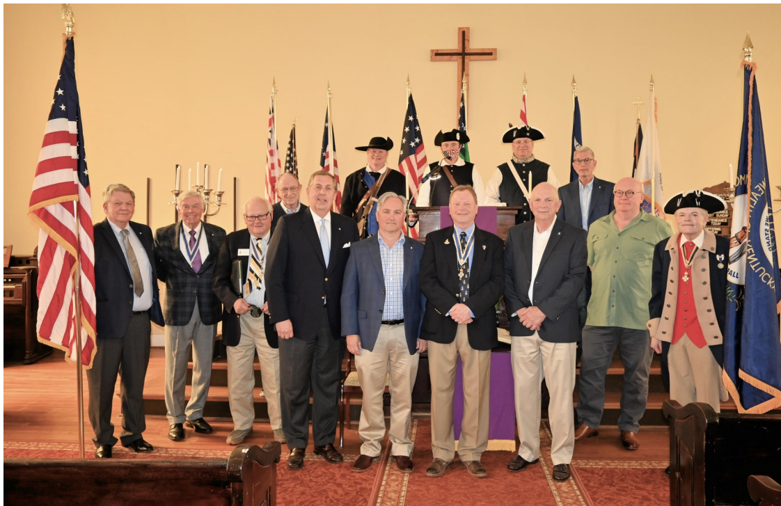
First in person meeting for Lafayette Chapter in over a year.