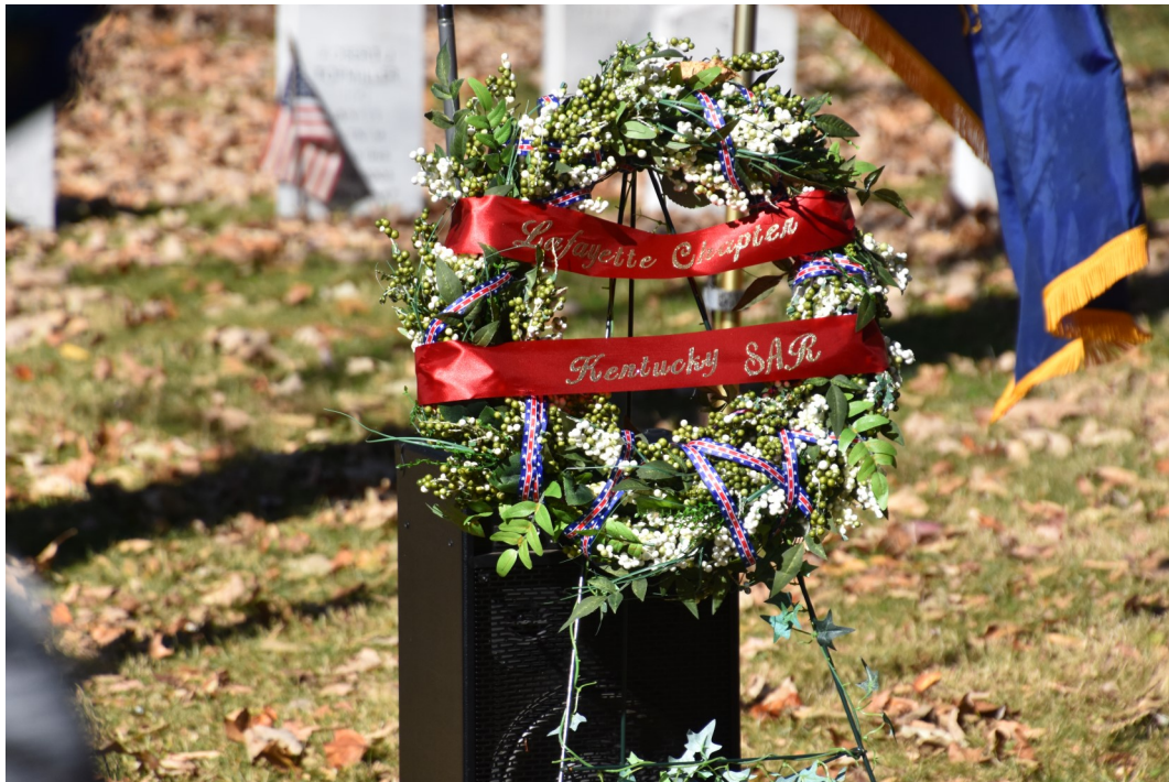
Lafayette Chapter Wreath, KY SAR