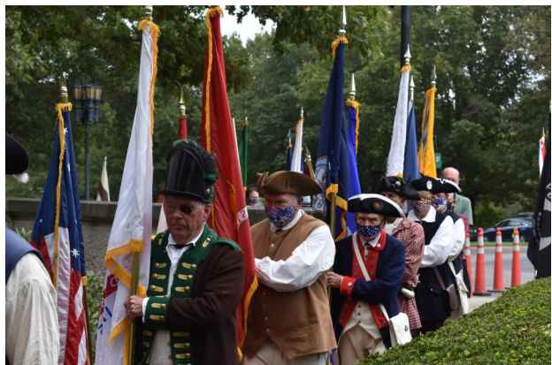
The Lafayette Chapter participated in the Color Guard during the dedication ceremony.