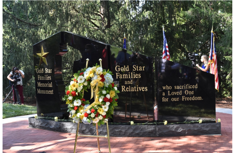
The Woody Williams Foundation was responsible for establishing the monument.

On Sunday, September 27, 2020, the Commonwealth of Kentucky unveiled the Gold Star Memorial Monument. It honors families who have lost loved ones serving in the military during times of conflict.