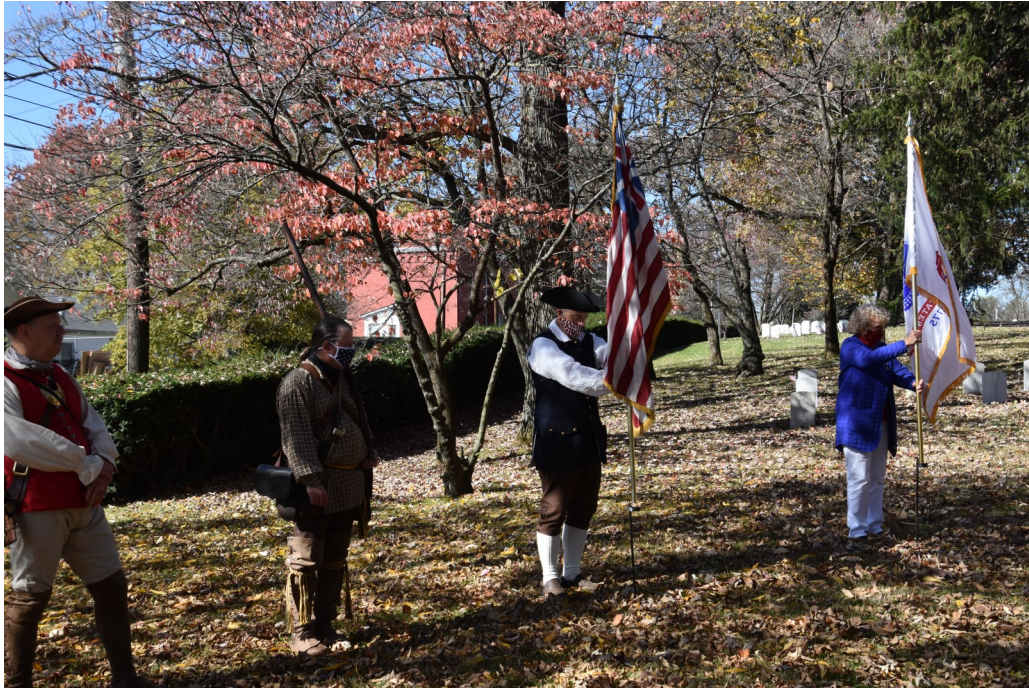
Posting of the Colors