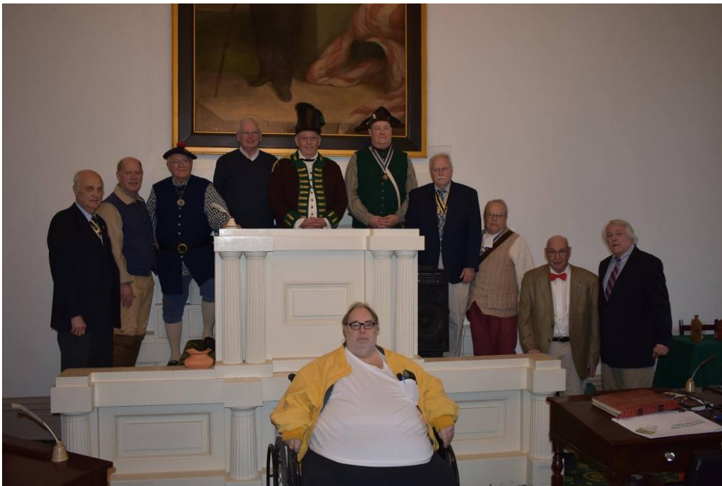
Kentucky State Officers for 2019-2020